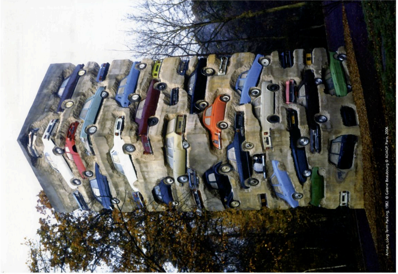
Arman, Long Term Parking, 1982. © Galerie Beaubourg © ADACP, Paris, 2006.