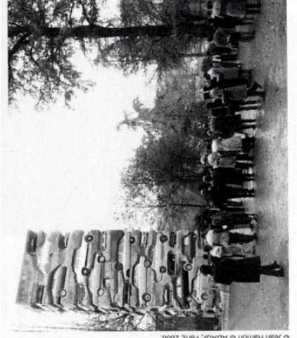
© Jean Hamon © ADACP, Paris, 2006.